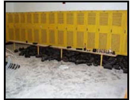
This is the locker room.