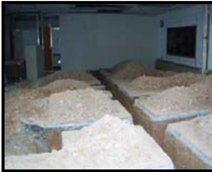
This is the science room.

The Elementary has to attend school at the Community Building for the first week of school.